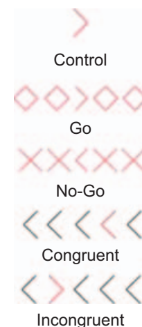
Fig. 1. Sample stimuli used in the control and flanker tasks. On control trials, a single red chevron pointed either left or right. These trials provided baseline response times. Four kinds of flanker trials were presented. On go trials, a central red chevron was flanked by four red diamonds, two on each side. On no-go trials, the chevron was flanked by four red Xs. On congruent trials, distractor chevrons pointed in the same direction as the target red chevron. On incongruent trials, distractor chevrons pointed in the opposite direction as the target red chevron.

Participants were given a set of flanker tasks modified after Bunge, Dudukovic, Thomason, Vaidya, and Gabrieli (2002). The stimuli were red chevron heads flanked by four distractors, as shown in Figure 1. Participants were instructed to indicate the direction the red chevron was pointing as quickly and accurately as possible. There were three types of blocked trials. Control